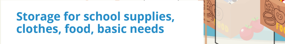
Storage for school supplies, clothes, food, basic needs